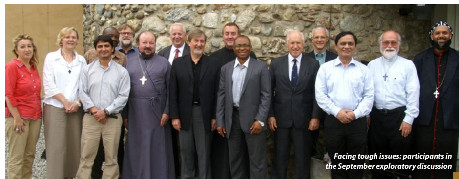
Facing tough issues: participants in the September exploratory discussion

As a result of the September exploratory discussion the GCF committee has agreed to initiate further conversations with global interchurch bodies and Christian World Communions on the issue.