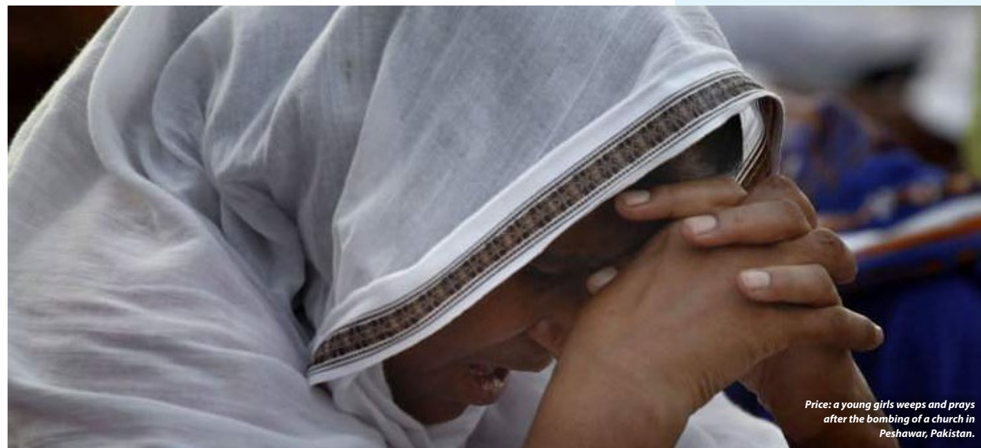
Price: a young girls weeps and prays after the bombing of a church in Peshawar, Pakistan.