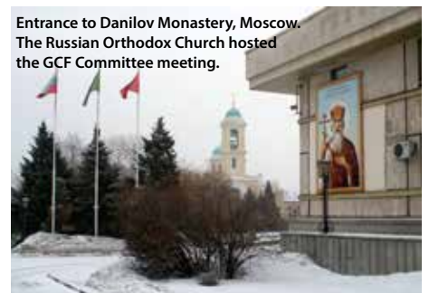
Entrance to Danilov Monastery, Moscow. The Russian Orthodox Church hosted the GCF Committee meeting.