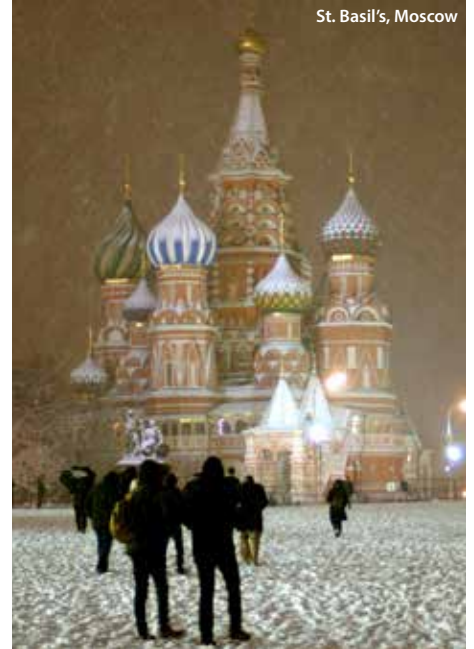
St. Basil's, Moscow