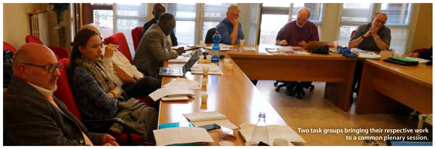
Continued from Page 2

As the Task Group met, a strong feeling emerged that the production of the Statement may represent a 'Kairos moment' for the churches, as they seek to speak interconfessionally and globally into an issue that continues to confuse and hurt the church in so many places.