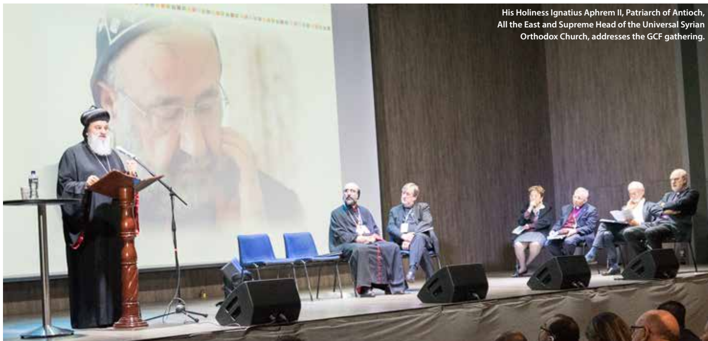
His Holiness Ignatius Aphrem II, Patriarch of Antioch, All the East and Supreme Head of the Universal Syrian Orthodox Church, addresses the GCF gathering.