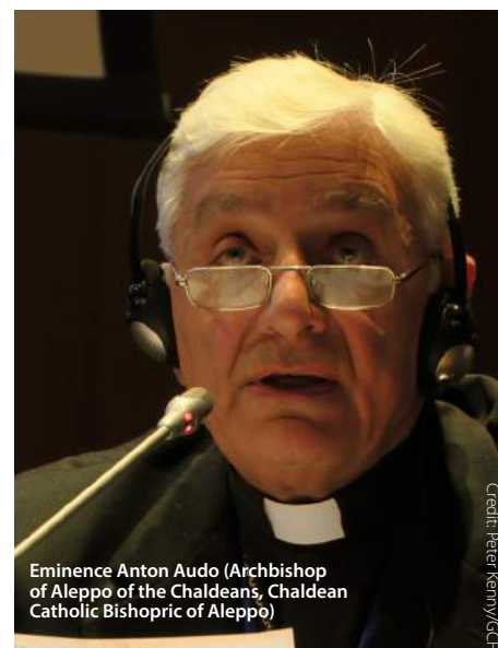
Eminence Anton Audo (Archbishop of Aleppo of the Chaldeans, Chaldean Catholic Bishopric of Aleppo)