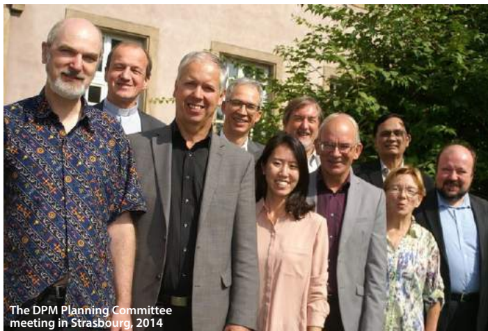
The DPM Planning Committee meeting in Strasbourg, 2014