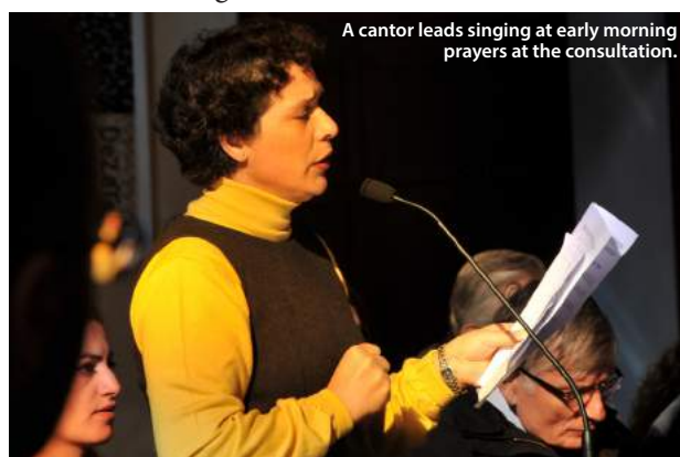
A cantor leads singing at early morning prayers at the consultation.

The result: for the first time in the contemporary history of Christianity, people from almost every tradition across the breadth of the church family, and from across the globe, came together to discuss that growing, worrying, and sensitive topic: ‘discrimination, persecution, martyrdom – following Christ together’.