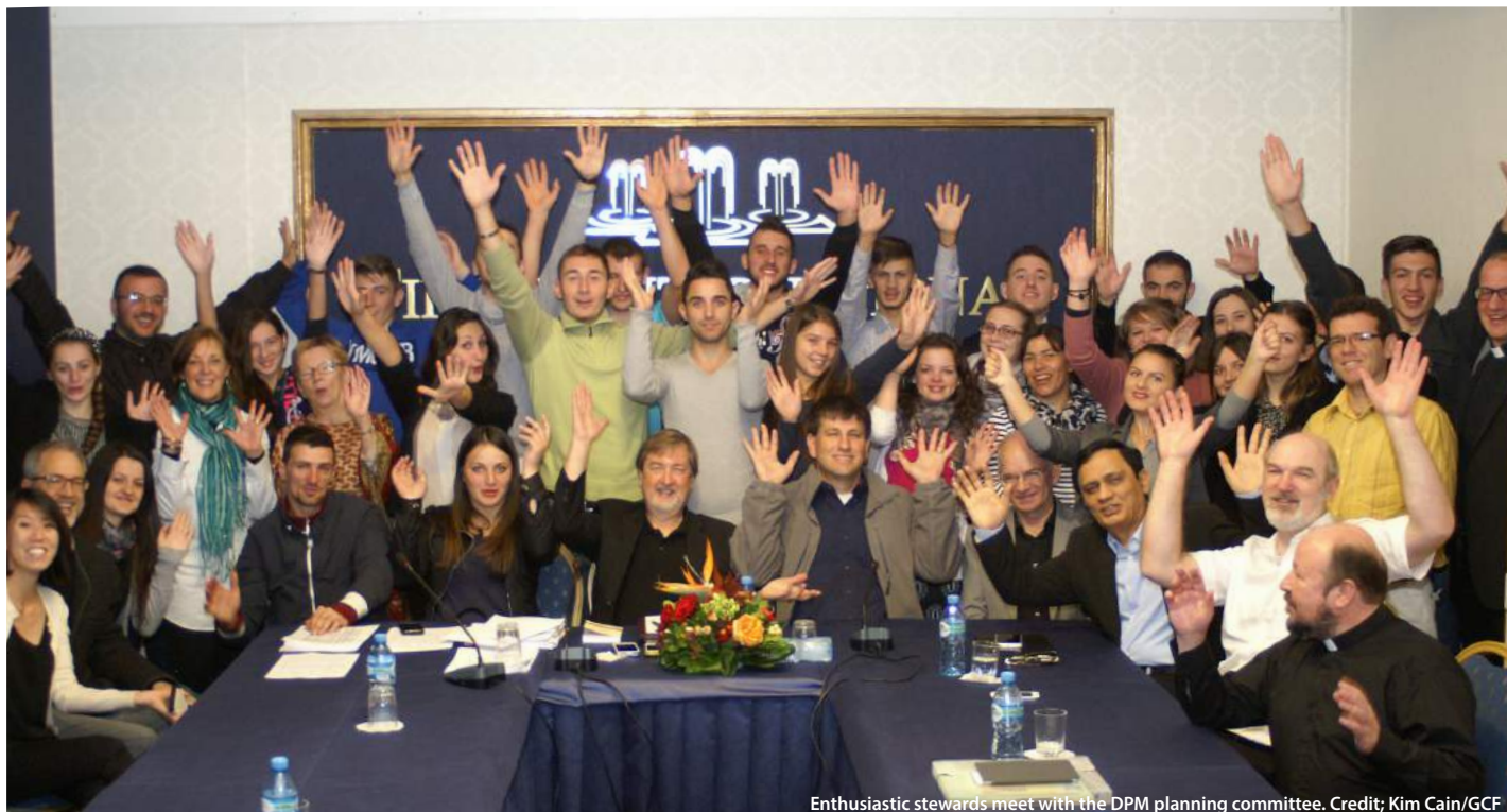
Enthusiastic stewards meet with the DPM planning committee.