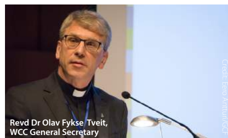
Rev. Dr. Olav Fykse Tveit, WCC General Secretary

“There is another way you (the suffering churches) are not alone: there are so many (others) from all cultures and faith communities who are also suffering injustice and