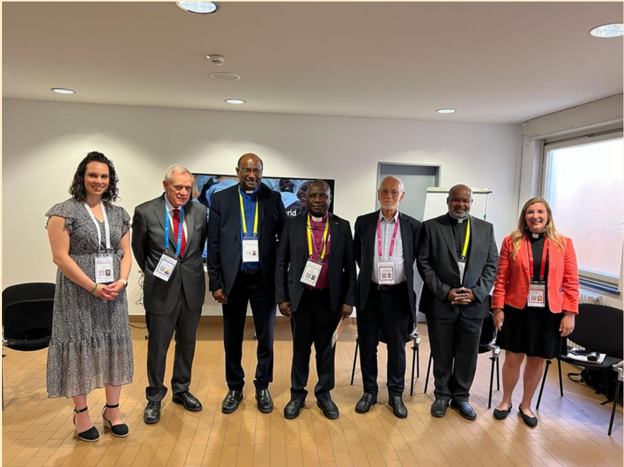
Speakers in the GCF Workshop in Karlsruhe.