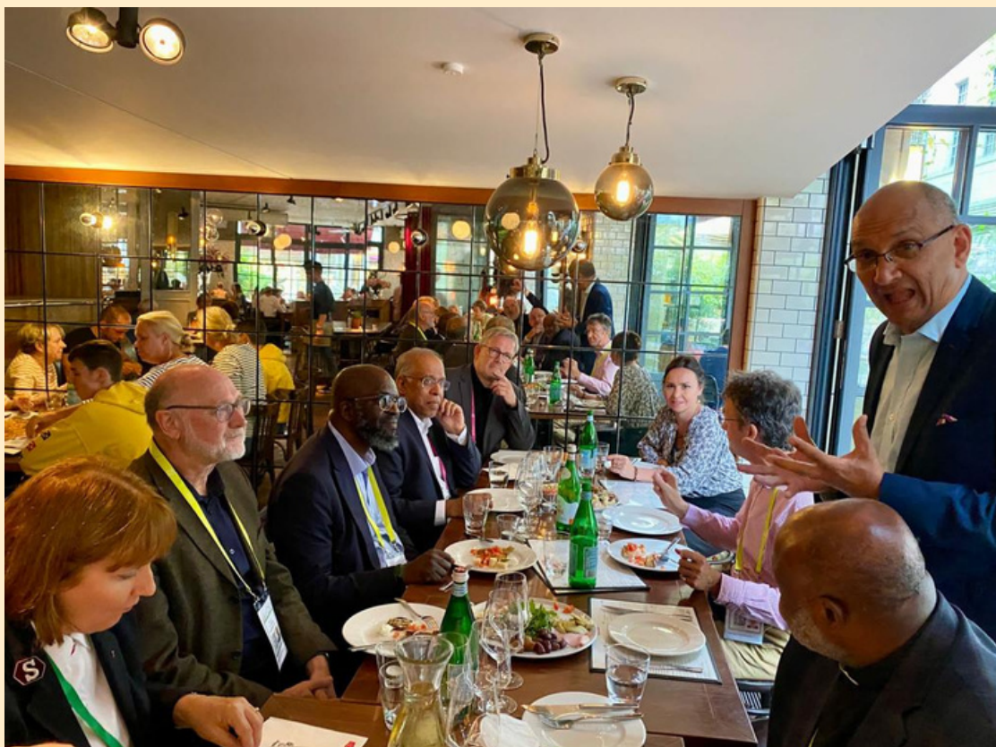
GCF participants join the United Bible Society for lunch during the WCC Assembly.