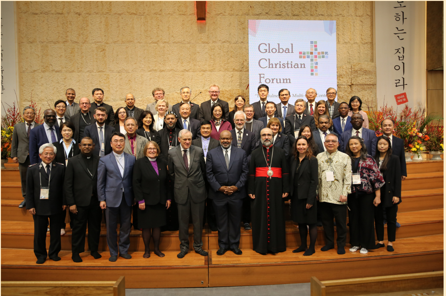
Regional leaders from the continent of Asia and GCF International Committee members gathered in Seoul for a regional consultation hosted by Myung Sung Presbyterian Church