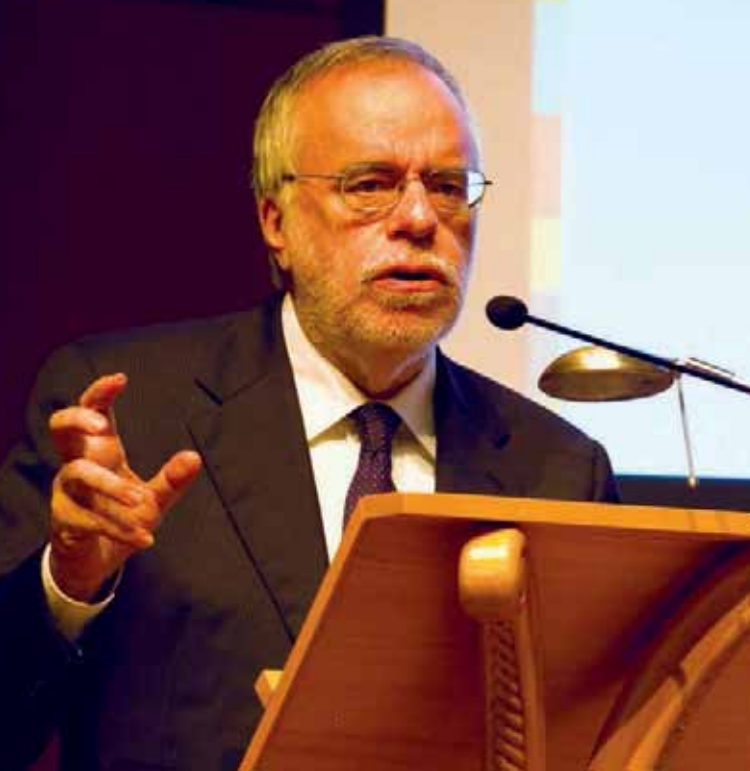
Left: Prof Dr Andrea Riccardi, Community of Sant'Egidio, delivers the keynote speech.