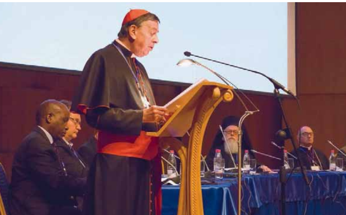
Below: Cardinal Kurt Koch, President of the Pontifical Council for Promoting Christian Unity.