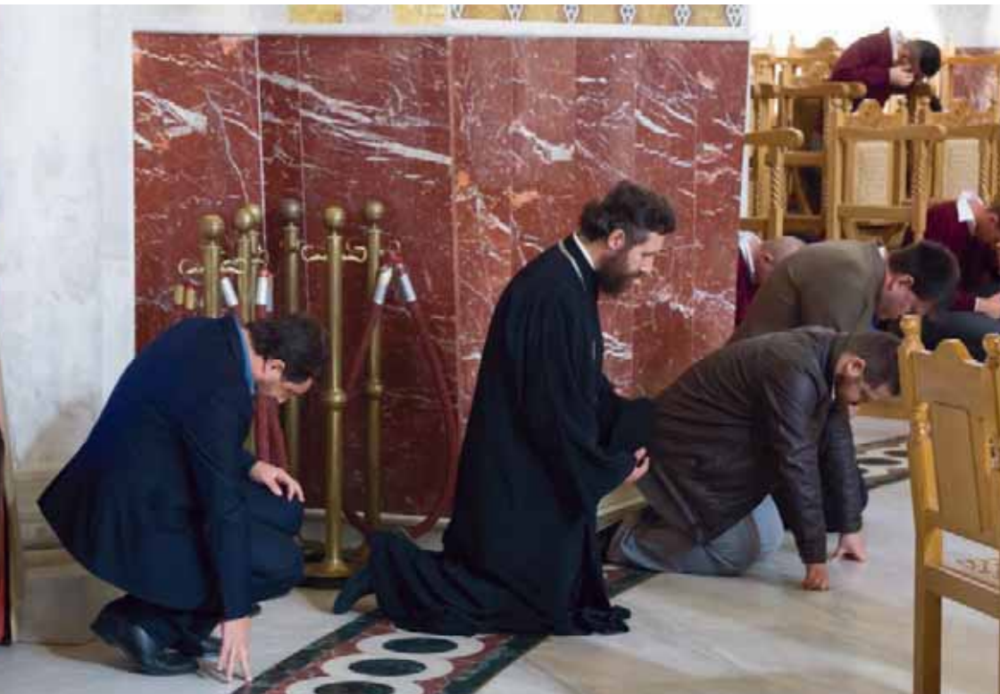
Below: The consultation took on a spirit of confession and regret as well as concern and hope. Here, a moment of confession during the opening service of morning prayers.