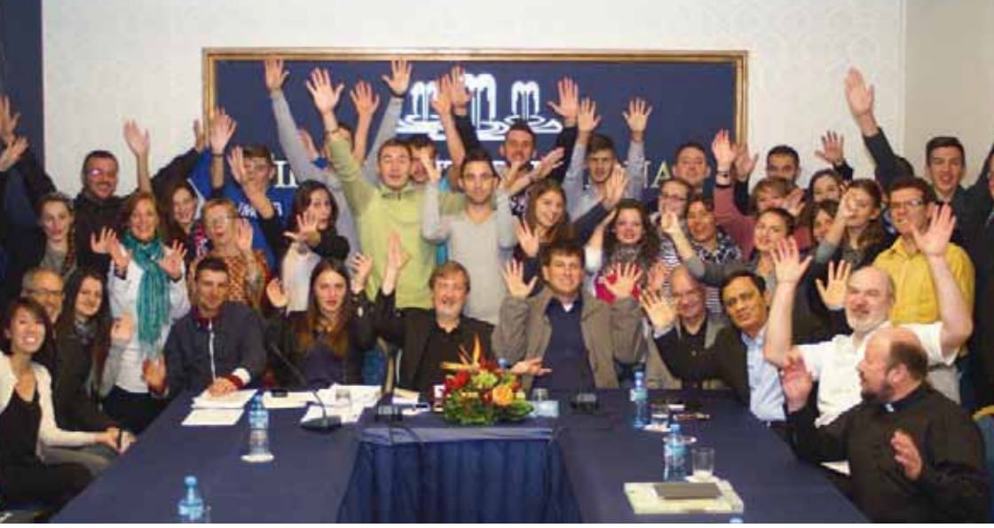
Above: The consultation was a unique ecumenical experience for young people drawn from Evangelical, Orthodox and Catholic communities in Tirana, as volunteer stewards for the conference. Here, meeting gathering organisers.