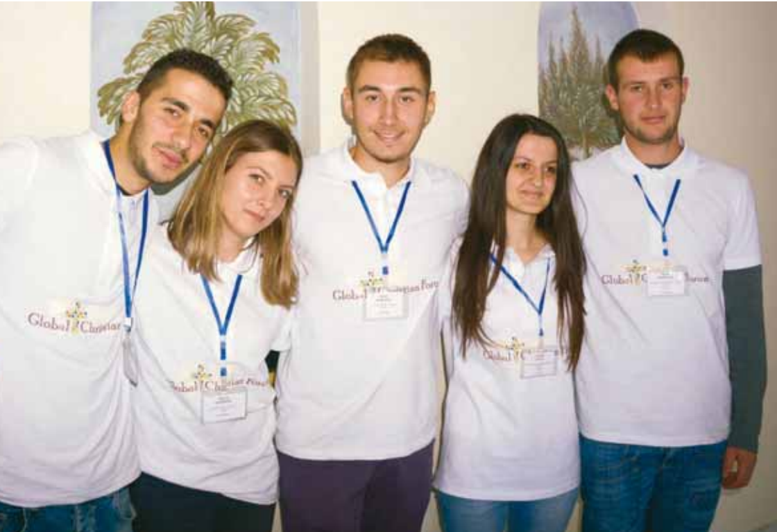
Below: Stewards in the unique GCF T-shirts; happy to meet and help.