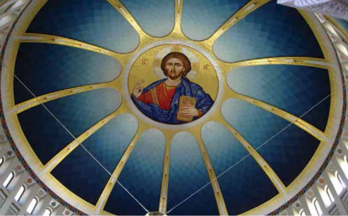
Above: Pantocrator mosaic, dome of the Resurrection of Christ Orthodox Cathedral, Tirana, Albania (Photo: Kim Cain).