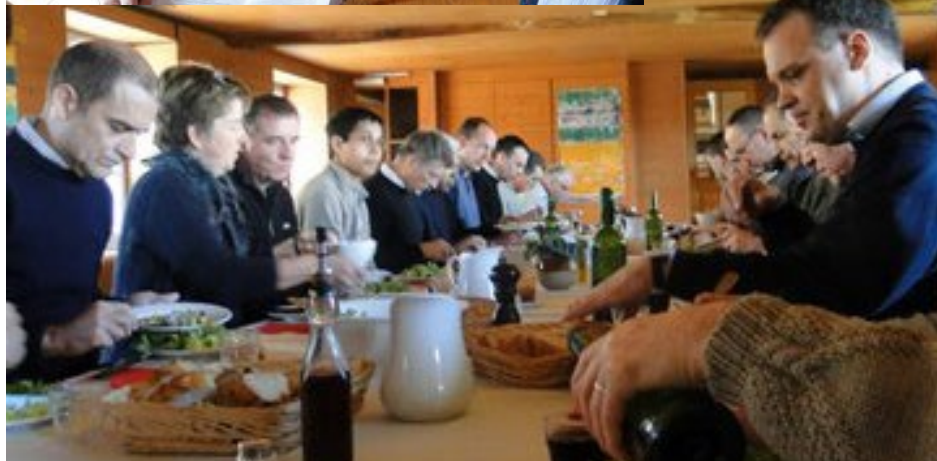
BELOW: Table fellowship at Taizé.